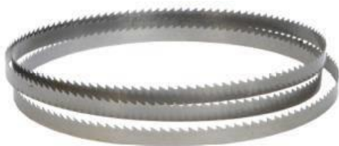
Available in 27 & 34 mm

In 2016 you can count on our excellent service like before as well as we will keep you informed about all the new developments